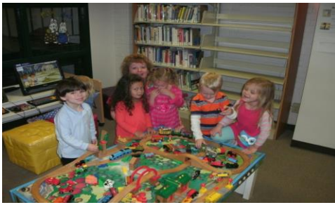
"Preschool 3 @ the Indiana Free Library"