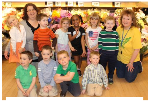
"Preschool 4 @ Martin's Grocery"