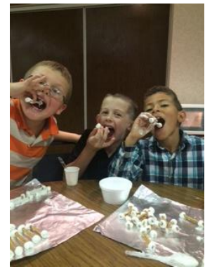
“2 nd Grade Students learning about dinosaurs & fossils”