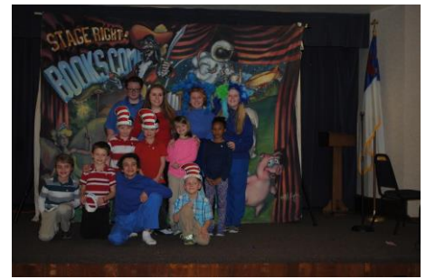
"1 st Grade with Stage Right"