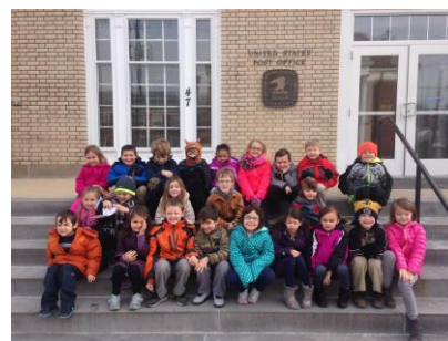
“Kindergarten & 1 st Grade at Indiana Post Office”

Because of President’s Day, we have taken time to feature two of our presidents and to discuss the current campaign as part of our Social Studies unit. We also learned about several of our national symbols (the Liberty Bell, Mt. Rushmore, and others).