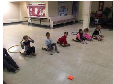
"Kindergarten Scooter Fun"

In 3 rd -5 th grade, we were able to travel to the YMCA for swim lessons for three weeks. Even though it was cold outside, the kids looked forward to going each and every week. I was able to teach the students three different strokes and introduce them to surface dives. We went over front crawl, elementary back stroke, and back stroke. They were all quick learners and were soon swimming like fish. On the final day, I was able to introduce them to surface diving and a kneeling dive from the pool's edge. I think that the students could have gone back every week for the remainder of the school year, they had so much fun.