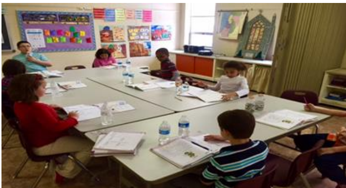
"Musical Water Bottle," Science Lab

"We love because He first loved us." 1 John 4:1