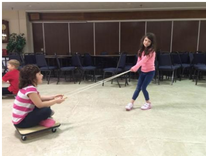
"Kindergarten Scooter Fun"