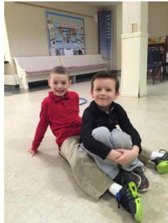
"Kindergarten Scooter Fun"