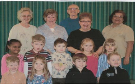
“Preschool 4 with members from Indiana Church of the Brethren”