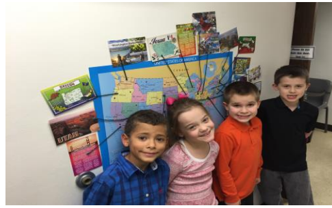
"2 nd Grade Students"