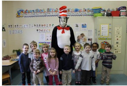
"Preschool 4 with the Cat in the Hat"