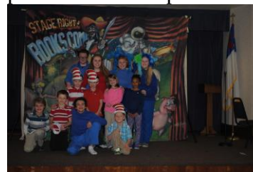
"1 st Grade with Stage Right"

First graders are looking forward to going to the IUP planetarium to view a program that will coordinate with their science unit on the sun, stars, and planets. Weather-permitting, students will walk to the planetarium on April 21.