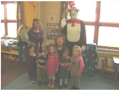
"Preschool 3 with the Cat in the Hat"