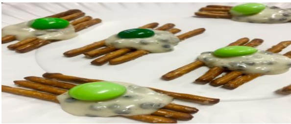
"Green Eggs & Ham"

The 3 rd graders have moved well-passed "Multiplication Masters," and are now conquering "Division Facts" like seasoned professionals. We also celebrated Dr. Seuss, during our "Wacky" week of March 14-18 th . Our class read fun stories, did crazy activities, experimented with messy science labs, played games, and had loads of fun dealing with each Dr. Seuss book we read. The students voted, and the two most exciting activities were making "green oobleck," during science, and making "green eggs & ham," as a baking experiment. In 3 rd grade, we just love our sweets, so we made our "green eggs and ham" using pretzels, Hershey kisses, and green M&M's...YUMMY!!!!