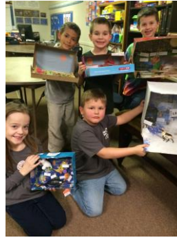
"2 nd Grade Students with their Science Projects"

The second grade class just finished a science unit on various environments around the world. They discovered that God's creativity can be found everywhere from the dry sandy desert to the colorful, lush rainforest! All environments have living and non-living things. Our research showed us that the non-living parts of an environment affect what can live in a place. We read all about the desert, the tundra, the woodland forest, the rainforest, the ocean and the pond environments. Each of the second graders chose an environment and created a diorama. The results were impressive! Their smiling faces show how proud they are of their masterpiece!